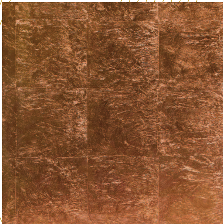
VERRE ÉGLOMISÉ MONTPELLIER COPPER LEAF