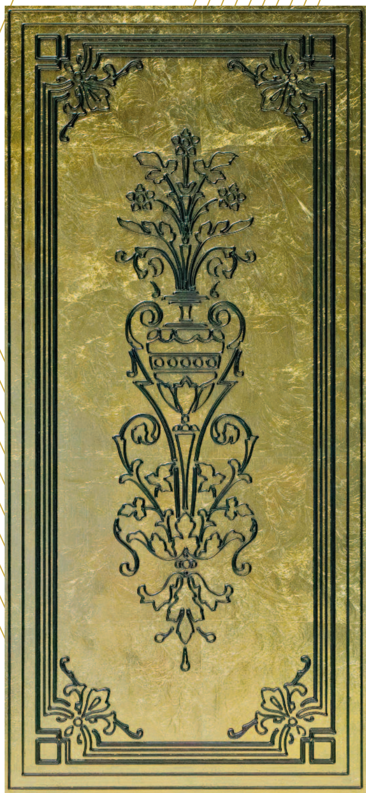
VERRE ÉGLOMISÉ MONTPELLIER GOLD WITH RESIN